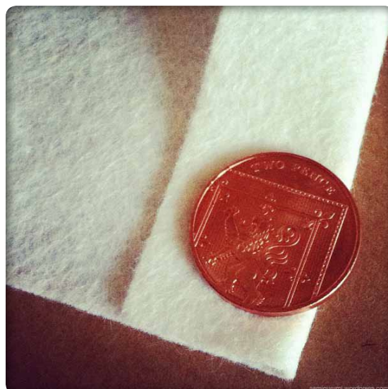
A 2p piece is a good eye size

Don't forget to send me your Zingy photos! samigurumi.wordpress.com