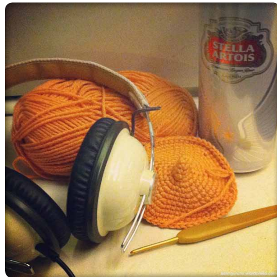
I laugh in the face of long train journeys